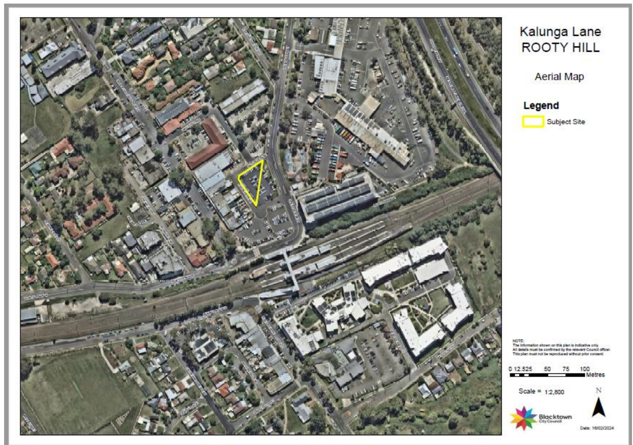
Figure 2 – Aerial Map of Subject land

The subject land was created by Deposited Plan 231084 registered on 28 November 1968. It was part of a subdivision approved by Council in 1963 for 5 shop sites, 2 residues, a laneway and road widening. Resolution (a)(iii) of the Council Subdivision consent required the applicant to transfer Lot 7 for car parking at no cost to the Council.